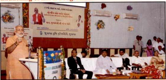
Shri Narendra Modi, Hon'ble Chief Minister, Gujarat launched LIFE project of JAU on August 14,2012

Shri Narendra Modi, Hon'ble Chief Minister, Gujarat, launched LIFE (Live Interaction with Farmers through Electronic media) project on August 14, 2012 in presence of ministers, vice chancellor, scientists of JAU and progressive farmers of Junagadh District at Auditorium, JAU, Junagadh. This programme aims at providing video conferencing between farmers at village and scientists at University through exhibition van equipped with AV aids and net connected devices. Live interaction between farmers and agricultural scientists will make the communication more effective.