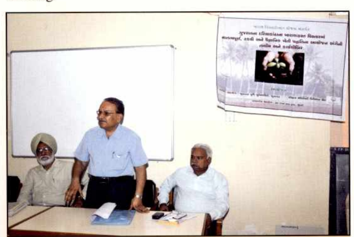
Training & Workshop on sustainable and scientific cultivation in coastal area

to generate more income, to make efficient water management for sustainable cotton production and to adopt value addition in cotton. Total 45 progressive farmers from different areas of Saurashtra region participated in this training.